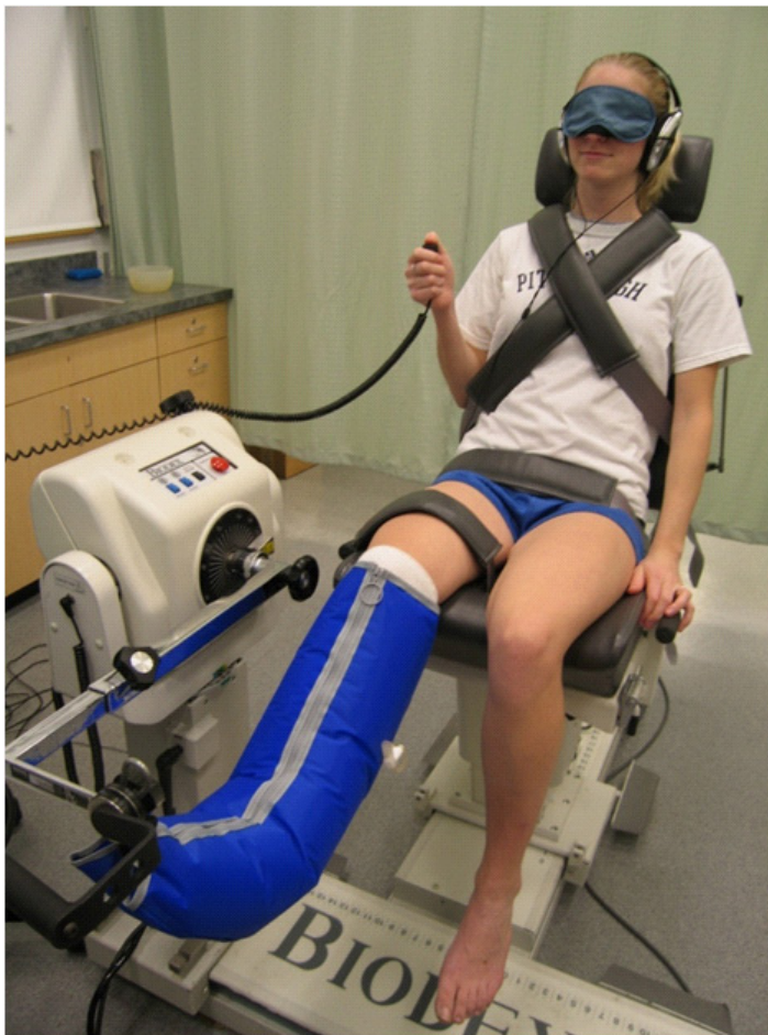
Figure 1: Threshold to Detect Passive Motion.

This research received no specific grant. The authors have no financial relationship to disclose. The authors would like to thank the subjects for their participation.